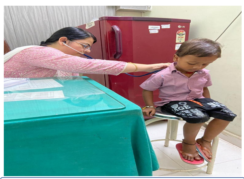
SPECIALIST VISIT (PEDIATRICIAN) AT UPHC KHOKHOPARA IN THE MONTH OF OCTOBER