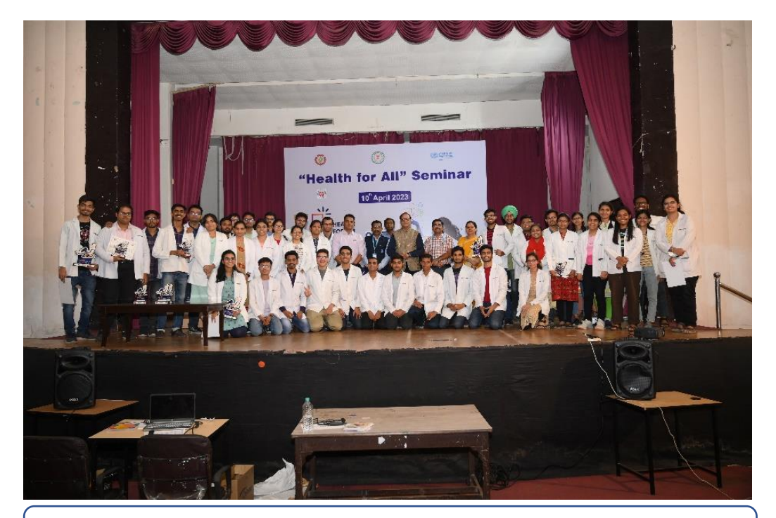
STUDENTS IN THE WORLD HEALTH DAY QUIZ ALONG WITH FACULTIES HELD IN THE MONTH OF APRIL